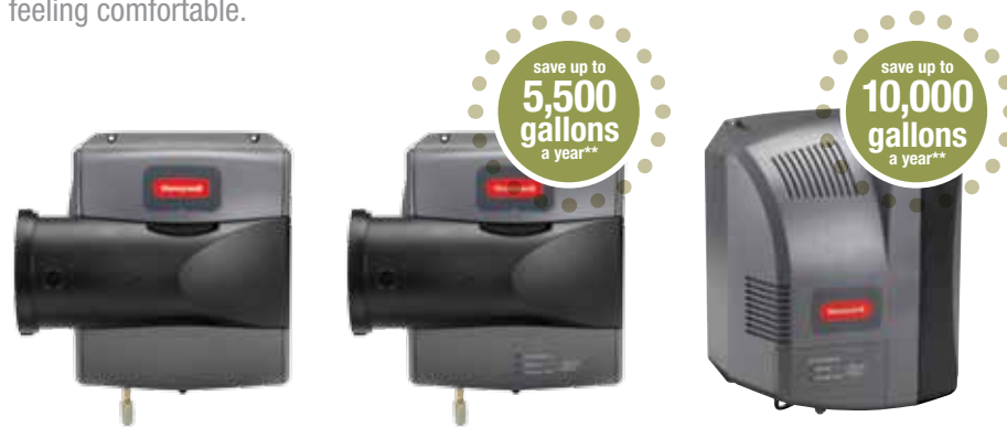
Basic Bypass Model

And that's just the beginning. Because humidified air feels warmer, you'll be able to cut energy costs by turning your thermostat down while still feeling comfortable.